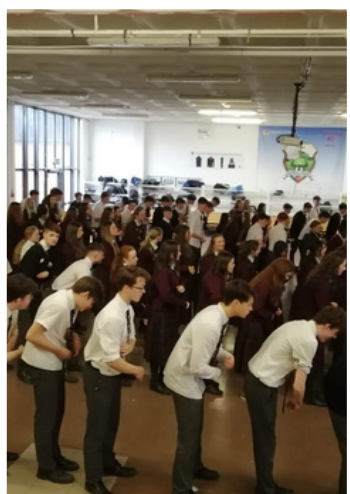
An céilí mór