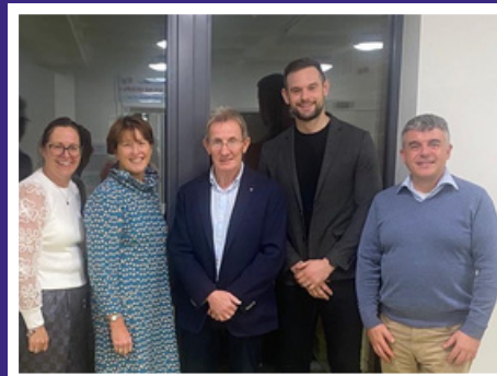
Parents association AGM