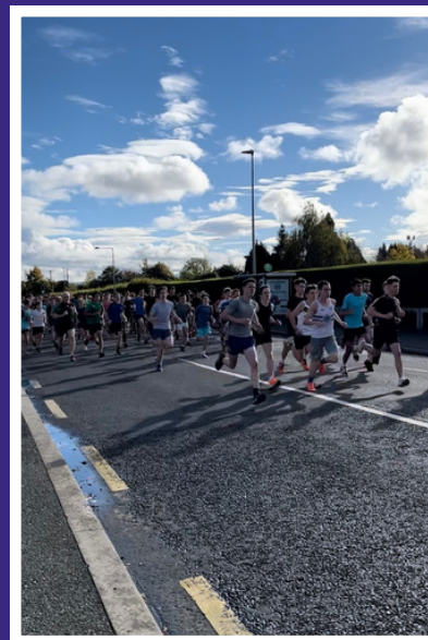
Annual road race 2023