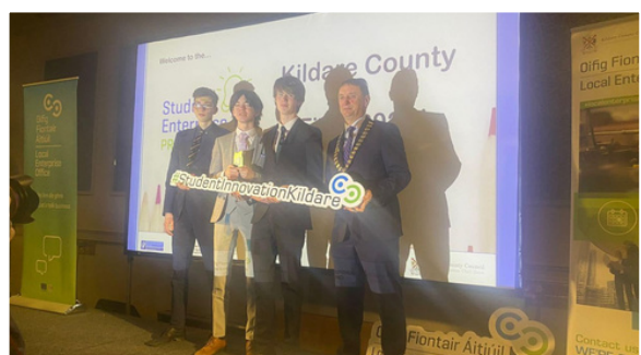
Student Innovation awards - 2nd place winners