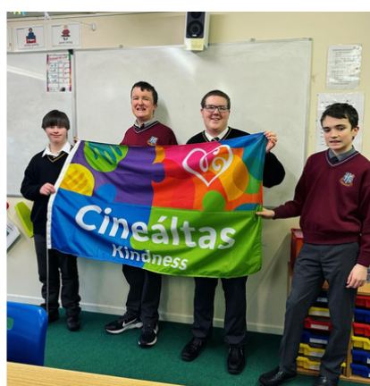
Celebrating Kindness week